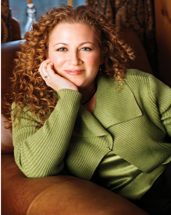
JODI PICOULT

Also author of Handle with Care , My Sisters Keeper , Change of Heart , Nineteen Minutes and others!